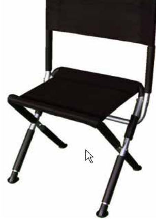
quality insulated chair comes with each sauna